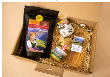
The fine pleasure box of the Dachstein Salzkammergut holiday region The content may vary depending on the season.